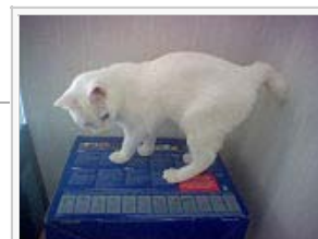
A stumpy white female