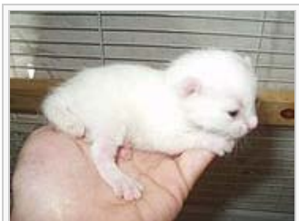
A week old female Manx kitten. Note the stumpy tail.

Manx kittens are classified according to tail length: