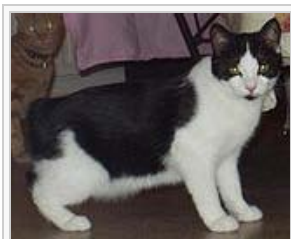
Another rumpy or possibly rumpy-riser Manx

"Manx Syndrome" is a colloquial name given to the condition which results when the mutant tailless gene shortens the spine too much. It can seriously damage the spinal cord and the nerves causing spina bifida as well as problems with the bowels , bladder , and digestion . Some only live for 3 years; the oldest recorded was 5. In one study it was shown to affect about 20% of Manx cats, but almost all of those cases were rumpies, which exhibit the most extreme phenotype . [2] Actual occurrences of this are rare in modern examples of the breed due to informed breeding practices. [6] Most pedigreed cats are not placed until four months of age (to make sure that they are properly socialised) and this gives adequate time for any health problems to be identified. [citation needed] Renowned feline expert Roger Tabor has stated that "Only the fact that the Manx is a historic breed stops us being as critical of this