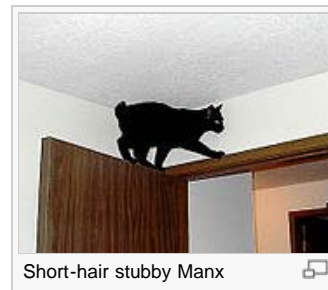
Short-hair stubby Manx

Manx cats exhibit two coat lengths . The short-haired Manx has a double coat with a thick, short under-layer and a longer, coarse outer-layer with guard hairs . The long-haired Manx, known to some cat registries as the Cymric , has a silky-textured double coat of medium length, with britches, belly and neck ruff, tufts of fur between the toes and full ear furnishings. The Cat Fanciers' Association (CFA) considers the Cymric to be a variety of Manx and judges it in the short-hair division, while The International Cat Association (TICA) judges it in the long-hair division. Short- or long-haired, all Manx have a thick double-layered coat.